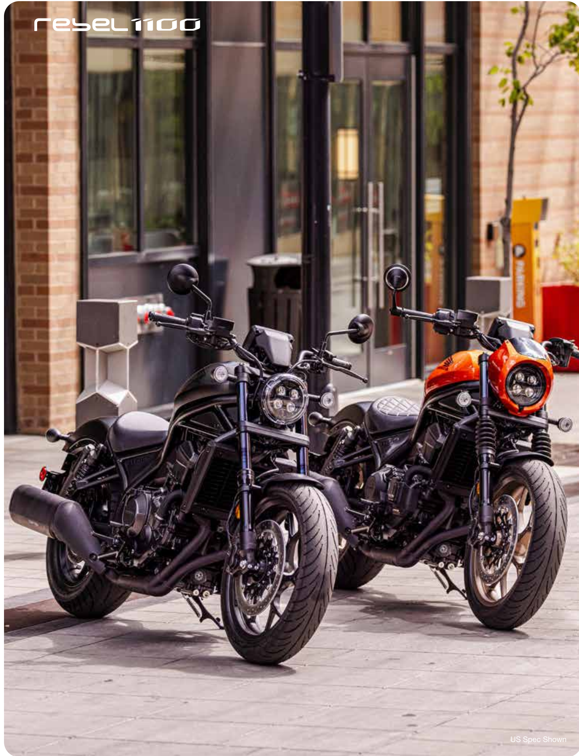
US Spec Shown