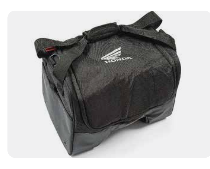
INNER BAG FOR 38L TOP BOX