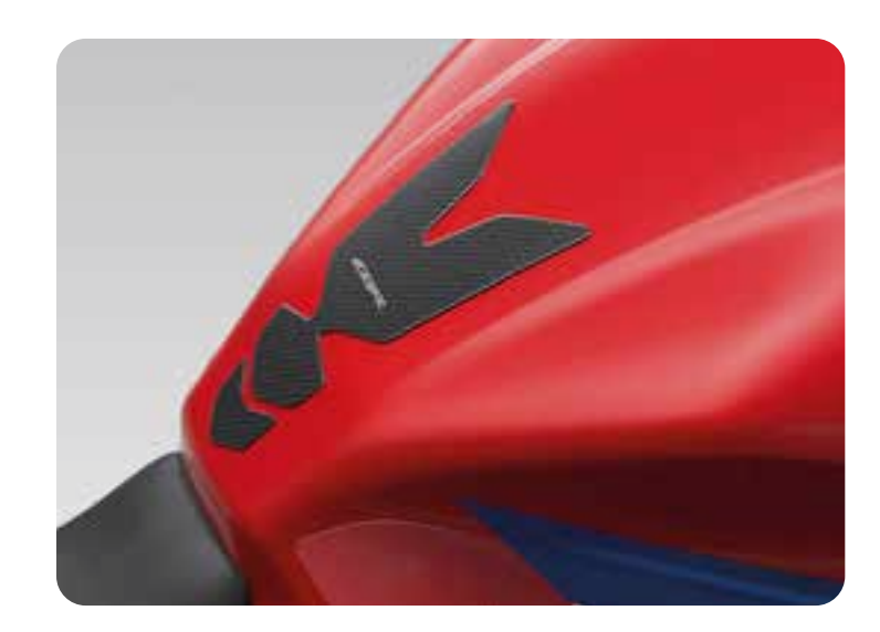
TANK PAD 08P82-MKR-D10 This rubber-made pad is exclusively designed to fit the tank shape and to protect it from scratches.