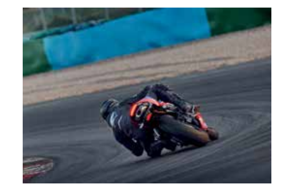
The CBR600RR in action.

Inline fours are the apex predators of the sportbike world. This is the kind of engine that our World Superbike and Supersport riders race. And if you've ever ridden a bike like our CBR600RR it's easy to see why. The engines are super-responsive and high revving. The handling is scalpel sharp. And our CBR600RR combines all that with the light weight of a 600-class machine—and light weight is the key to all sorts of performance benefits. A rare breed these days, fours like the CBR600RR are a delight for track-day use, and outstanding on twisty back roads.