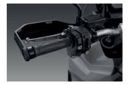
HEATED GRIPS 08T71-MKT-D00

Featuring the X-ADV logo, the deflectors set improves the comfort by reducing the airflow around your waist and your thighs.