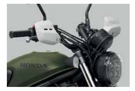
KNUCKLE GUARDS 08P71-K3S-JA0 A specially designed knuckle guard that matches the motorcycle design.

It is a specially designed up fender that matches the vehicle design, and uses lightweight and shock-resistant polypropylene resin. With this fender, the scambler look is enhanced.