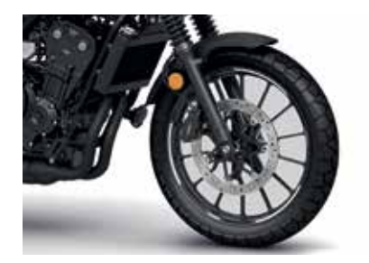
WHEEL STRIPES 08F74-K3S-JA0ZA / 08F75-K3S-JA0ZA Exclusively designed wheel stripes that match the CL500 design for a sporty look.

The tank pad, featuring the Honda logo, helps to protect the Tank paintwork from scratches and rubbing.