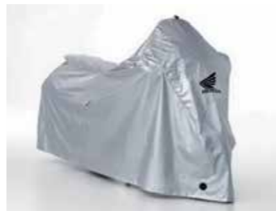
OUTDOOR CYCLE COVER 08P34-BC2-801

A water-resistant and breathable cover that allows your bike to dry whilst covered. Protects the paintwork from UV rays. Supplied with an anti-flutter rope and two security holes.