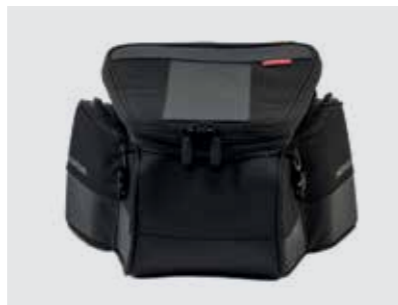
REAR SEAT BAG 08ESY-MKJ-STB18

Dimensions in mm (W x L X H): 178 x 285 x 130.