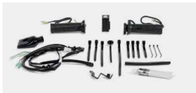
GRIP HEATERS KIT 08ESY-MKN-HG19B

Extremely slim heated grips that provide 360° heat all around them with smart allocation that focuses on the area of the hands most sensitive to cold. Features integrated control for maximum rider comfort and design integration. 3-step variable heating levels are available. An integrated circuit protects the battery from draining. This kit includes the attachment and the special heat-resistant cement.