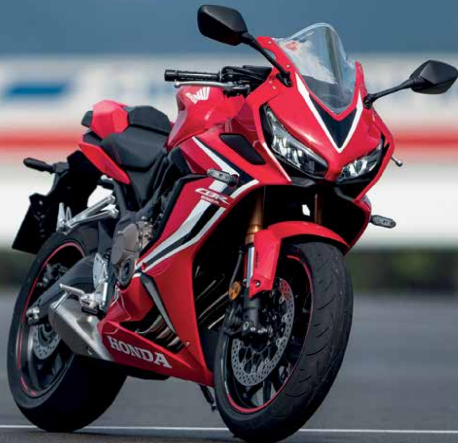
19YM Action Photo