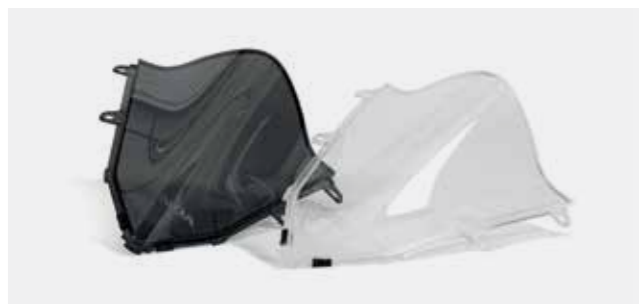
HIGH WIND SCREEN 08R70-MKN-D10 / 08R71-MKN-D10

Replacement screens offering additional wind protection without compromising visibility. 2 models available: