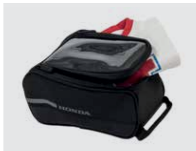
TANK BAG 08ESY-MKJ-TKB18

Functional 3-litre capacity bag fitting the tank. The stable mounting does not disturb the handling of the CBR650. Clear pocket on the top for easy smartphone storage. Rain cover and attachment included.