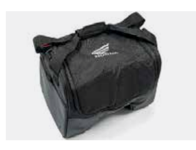
INNER BAG FOR 38-L TOP BOX 08L75-MJP-G51

Black nylon bag with embroidered silver Honda wing logo on the top and red zippers. Comes with adjustable shoulder belt and carrying handle.