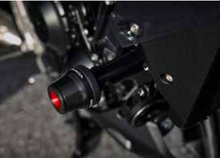
SKID PAD 08P00-MLT-D00 The Skid Pad will help to reduce damage to featurings in case of a fall