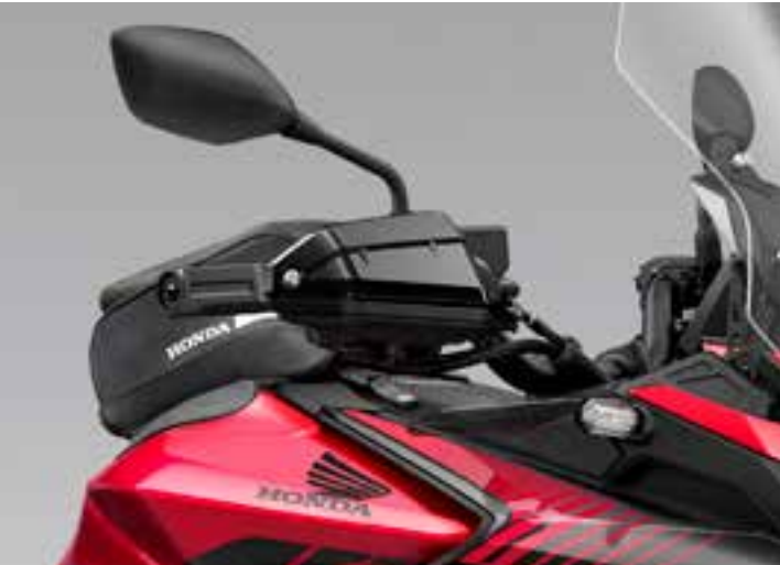
KNUCKLE GUARD EXTENSIONS 08P72-MKS-E00ZC The Radiator Grill's design effectively mitigates the risk of radiator core damage caused by debris impact. • Material: Stainless steel • Combines efficiency and protection • Features an authentic mesh design • Perfectly fits with the motorcycle design