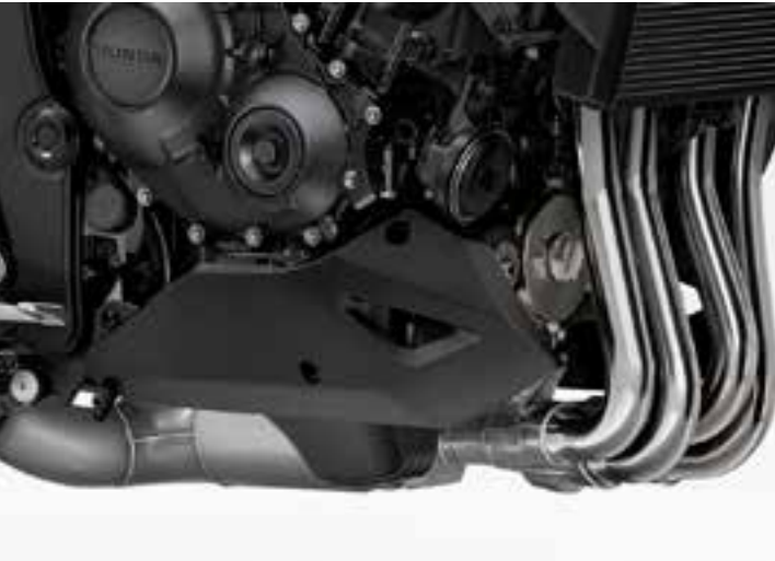
UNDER COWL 08F00-MLT-D00ZA The Under Cowl *NHA86M* is contoured around essential engine components, ensuring not only protection but more importantly, enhancing the sportiness and highlighting the design cues of the motorcycle.