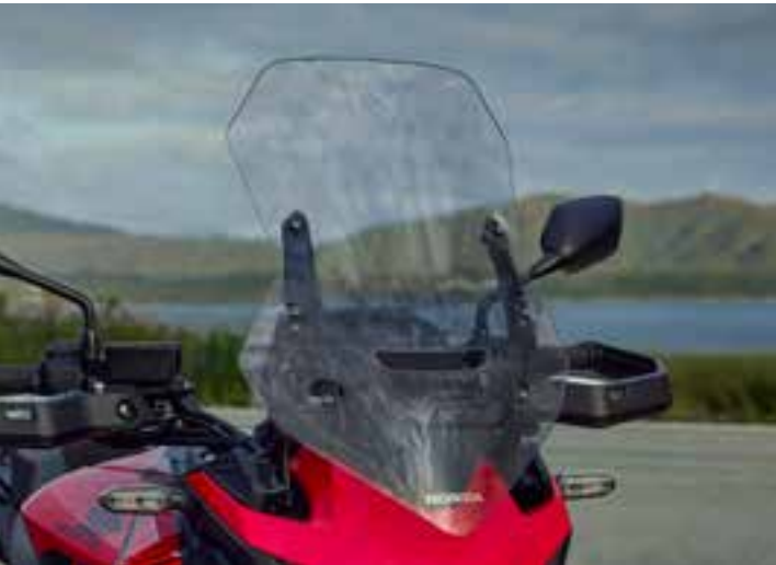
HIGH WIND SCREEN 08R00-MLT-D00 The Hight Wind Screen, reduces wind impact while allowing airflow and visibility.