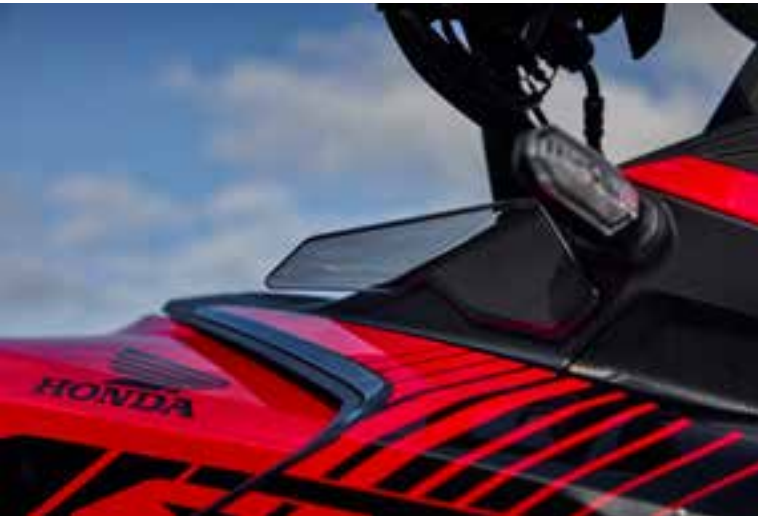
UPPER DEFLECTOR / LOWER DEFLECTOR 08R01-MLT-D00 / 08R02-MLT-D00