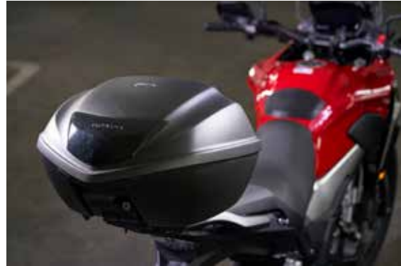
35L Top Box 08ESY-MJX-TBWK

35L Top Box designed to be operated with your CB500X key. This set includes all the components to mount the top box on the bike and the key system. € 547,13 (tva inclus)