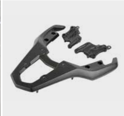
Rear Carrier 08L71-MGZ-D80ZA

35L Top Box designed to be operated with your CB500X key. This set includes all the components to mount the top box on the bike and the key system. € 547,13 (tva inclus)