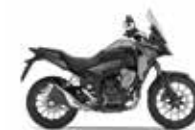
Mat Gunpowder Black Metallic