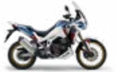
Pearl Glare White Tricolor