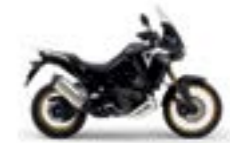
Digital Black Metallic

Perfect combination of accessories with special prices.