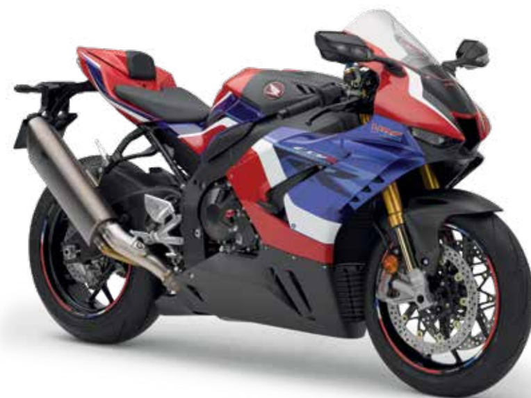
FIREBLADE SP WITH GENUINE CARBON FIBRE ACCESSORIES SHOWN.