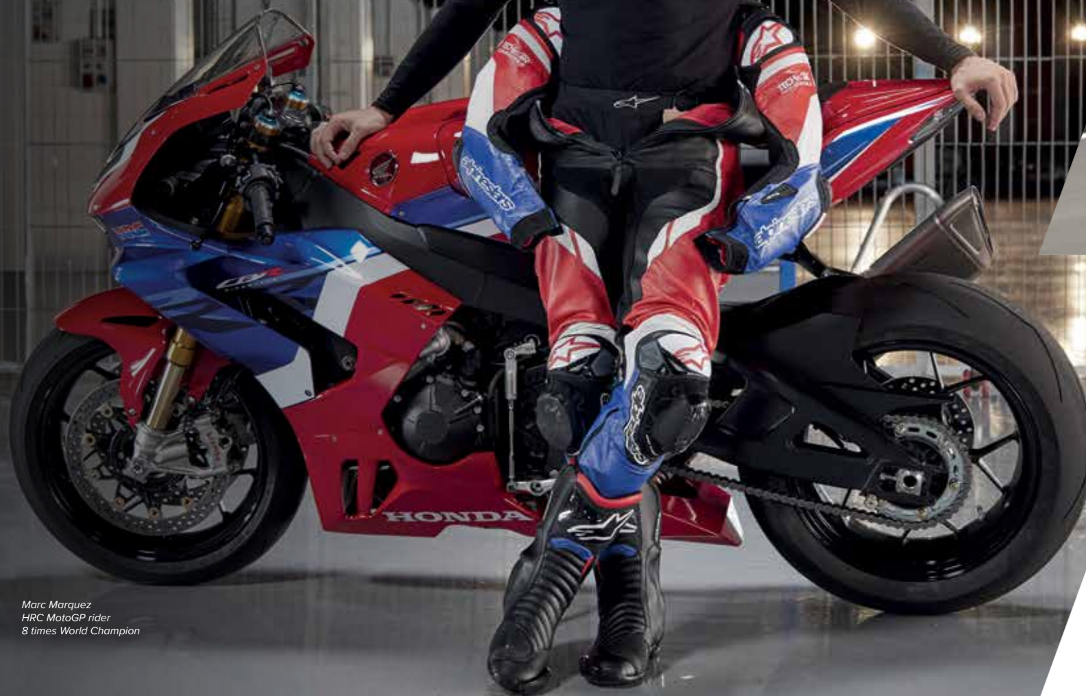
Marc Márquez HRC MotoGP rider 8 times World Champion

For you, there is no second best. For us it's the same. Which is why we started racing in the early 1960s and why we race today. Competition is always a challenge but it's what brings improvement. Raises the game. Yours. Ours.