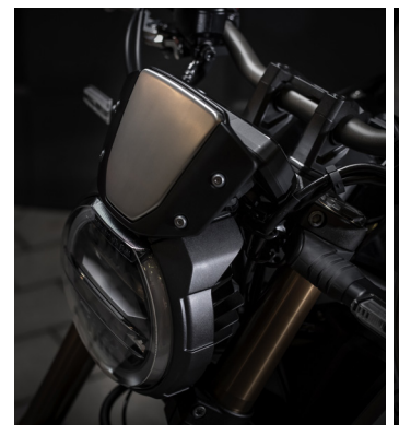
Meter Visor Kit 08R70-MKN-D50 The meter visor is fitted with a high quality

The meter visor is fitted with a high quality aluminum panel to further enhance the iconic look of the C8650R. Stays are sold separately (08R74-MKN-D50). € 126,34