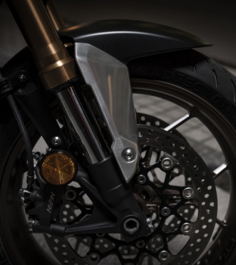
Front Fender Panels 08F73-MKN-D50

The meter visor is fitted with a high quality aluminum panel to further enhance the iconic look of the C8650R. Stays are sold separately (08R74-MKN-D50). € 126,34