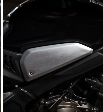
Side Covers 08F75-MKN-D50

Pair of high quality aluminium shroud covers to complete the iconic look of the CB650R. The shroud covers are beautifully engraved with the CB650R logo.