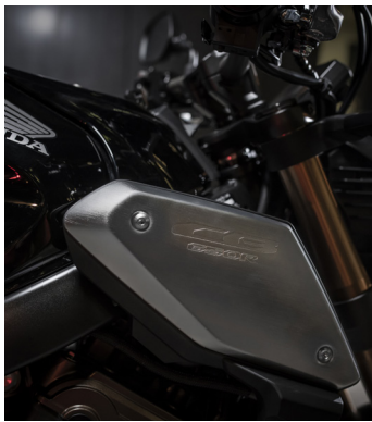
Shroud Covers 08F74-MKN-D50

High quality aluminium panel to add to the front fender {\bf \epsilon} 151,39