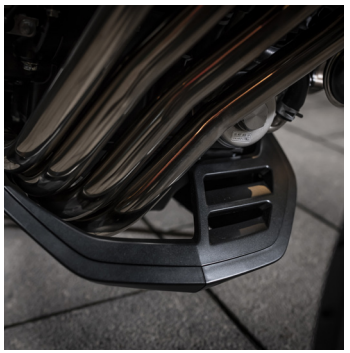
Under Cowl 08F71-MKN-D50ZA

High quality aluminium left and right panels that will cover the side of the bike. €157.57