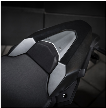
Rear Seat Cowl 08F72-MKN-D50ZB

Under cowl kit to improve the appearance of the bike. All parts to fit directly to the frame are included. Available in Mat Gun Powder Black Metallic. € 108,10